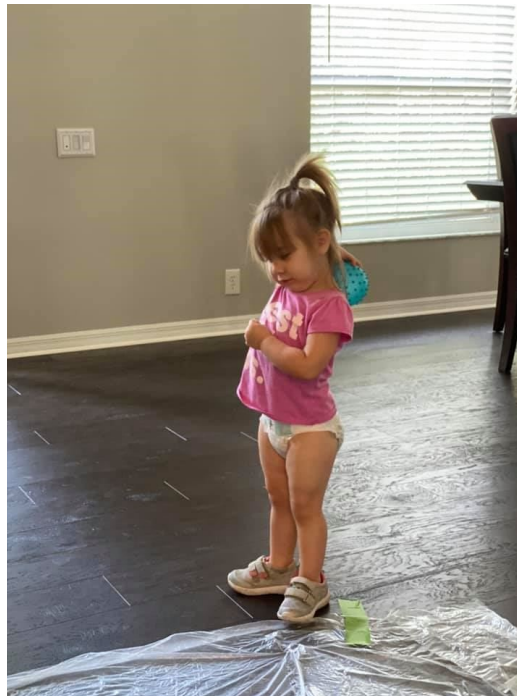
"Quarantine: Day 7 - Clearly my co-worker is unfamiliar with our office pants policy."